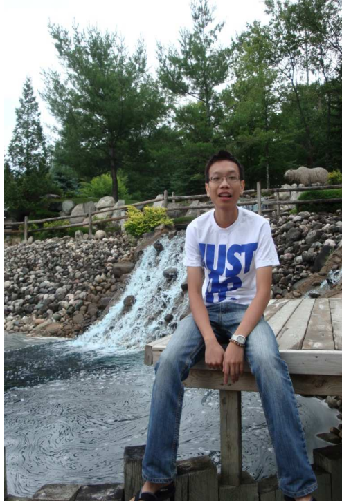
In Mackinac City, Michigan